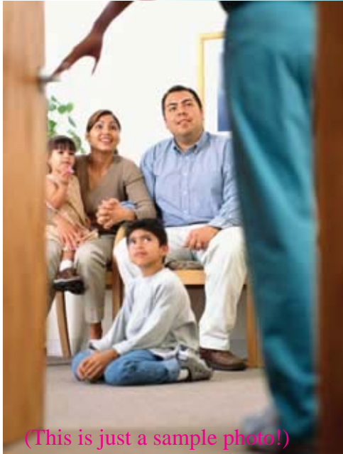
(This is just a sample photo!)

Join with your child's doctor for health care that's right for your family